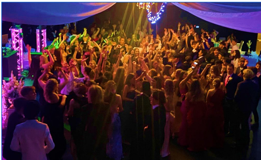
A NEWSLETTER TO PARENTS AND CAREGIVERS OF MORRINSVILLE COLLEGE