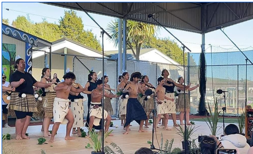
A NEWSLETTER TO PARENTS AND CAREGIVERS OF MORRINSVILLE COLLEGE