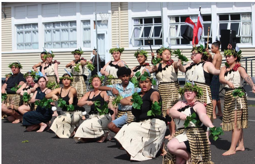
A NEWSLETTER TO PARENTS AND CAREGIVERS OF MORRINSVILLE COLLEGE